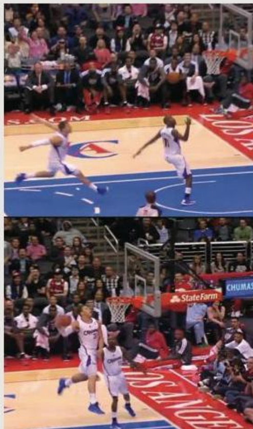
Blake Griffins descent into his vertical jump. Notice his arms are fully extended loading for takeoff.

Start the descent by throwing your arms down to your hips as fast as possible. As you do this your bodies reaction will cause your head/neck to flex forward at the same time your trunk/knees do. In the bottom position, your hands should be slightly behind your hips and you are now ready to explode up and through the roof. Use your dominant hand to reach as high as possible if you are testing your vertical or trying to dunk on someone.