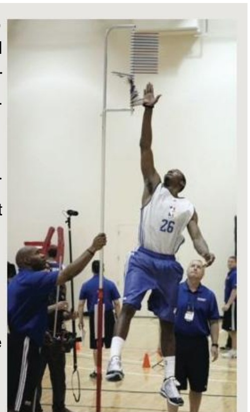
John Wall testing his vertical at the NBA combine.

to the pre-draft combines athletes engage in serious training to increase their vertical jump, the exact same training used in the Vert Shock training system. When you combine the Vert Shock training system with the hacks below you will maximize your returns.