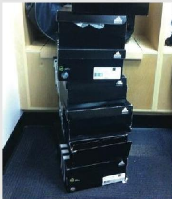
My locker at any given time. I have tried a lot of different basketball shoes. My Favorite? The Kobe's (not pictured here).

An insider secret to the Pre-Draft combines that not a lot of people know about is the type of shoe chosen when testing your vertical jump. Some athletes will actually wear a shoe that is one size TOO SMALL when they perform their vertical jump.